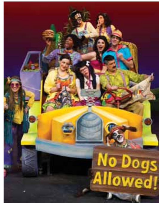
The cast from the Arvada Center production of No Dogs Allowed! .

General Admission tickets: $8; Reserved tickets: $10