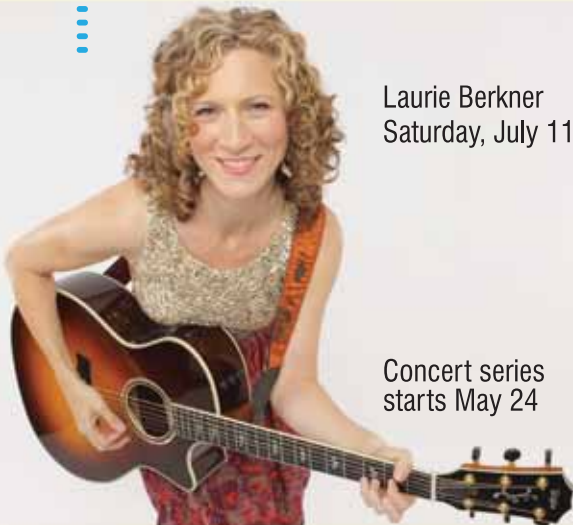
Laurie Berkner Saturday, July 11