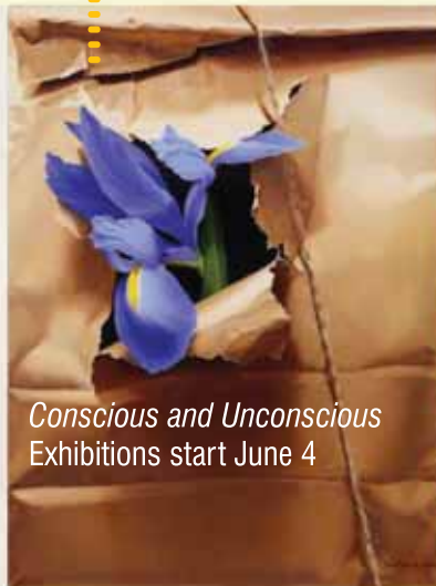
Conscious and Unconscious Exhibitions start June 4