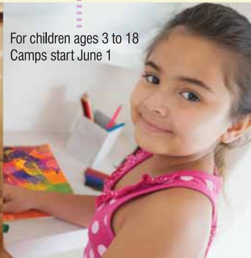
For children ages 3 to 18 Camps start June 1